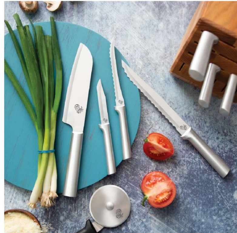
Emblem will not be black as above, but rather a classy silver rendition

Make Checks out to NE I Marine Corps League 1241 Mail to: WAVP—MARINE CORPS LEAGUE, 1241 1300 4 th St NW; Waverly, IA 50677