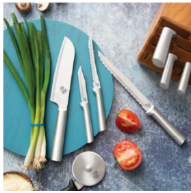
EGA Sample: use on any cutlery